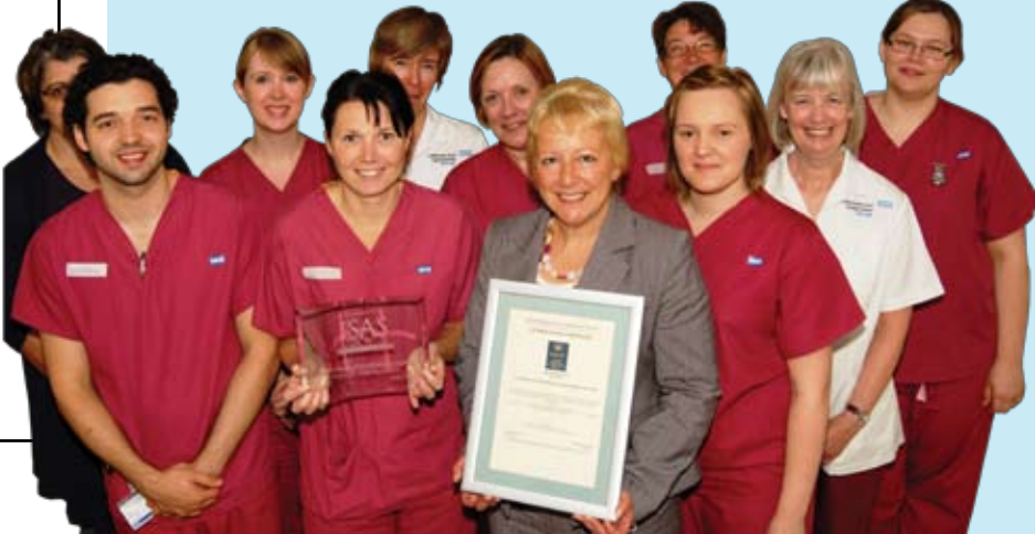
Below: members of our X-ray team. Right: The new renal unit.

To read the press releases, visit the Latest News section on the home page of our website www.cht.nhs.uk