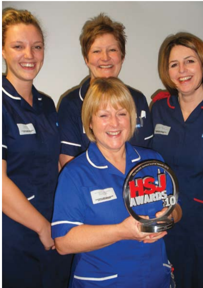
Celebration: Ward 12 staff with the HSJ trophy

"The competition was extremely strong for the award so to receive it in those circumstances is a real honour."