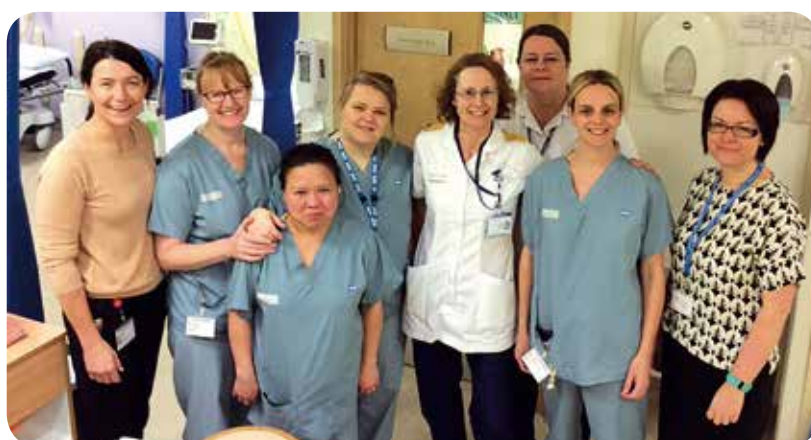
Nervecentre goes live on Endoscopy, above, and on the Macmillan Unit, right

The Nervecentre system has brought a large number of quality and safety benefits to our patients and the roll-out of hand-held mobile devices has ensured clinical staff receive