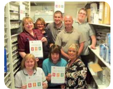
The LDRP team and Ward 11 have both delivered

The Procurement and Contracts team have been successful in the delivery of their £1.256 million savings target for 15/16 whilst minimising the impact this has on patient care.