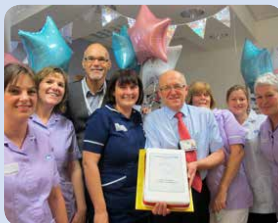
Our Assisted Conception Unit Team celebrating National Fertility Day

● Our assisted conception team also has a special email address which is free and confidential for anyone to send questions to our experts – chftfertilitydirect@cht.nhs.uk