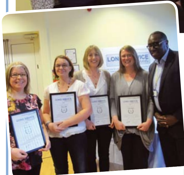
Above: the cardiology team