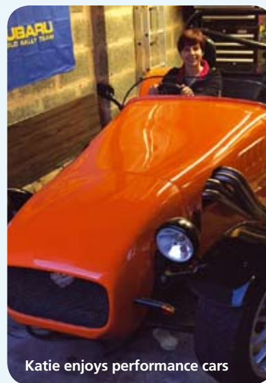
Katie enjoys performance cars

and end up at a nice pub with good food and a few drinks to unwind.