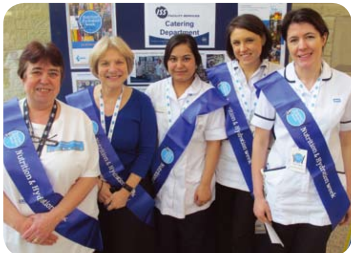
Dietitians, nutritionists and caterers at CRH